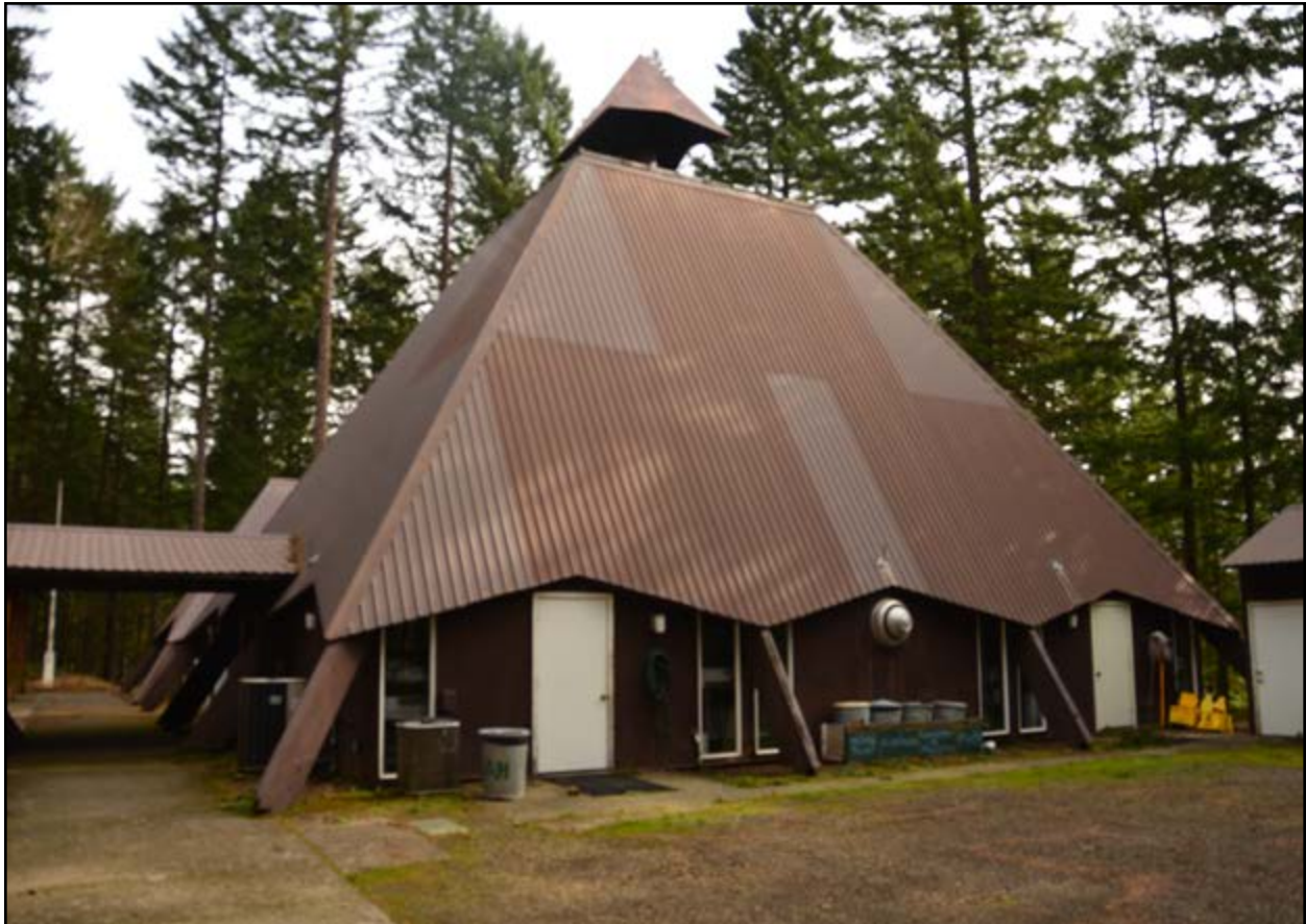
Girl Scout Camp Wind Mountain Lodge.

COMPILATIONS OF NOTES AND REMEMBRANCES OF THE WIND MT. AREA OF SKAMANIA COUNTY