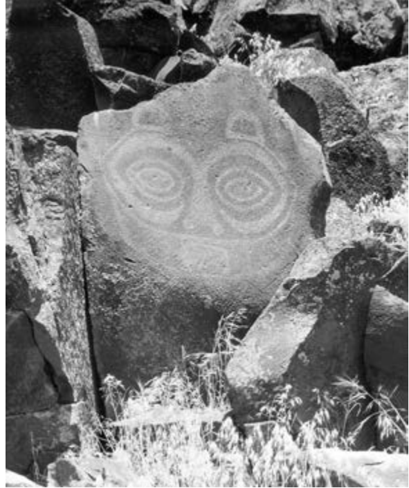
Tsagaglatal rock formation near Horsethief Lake, WA.