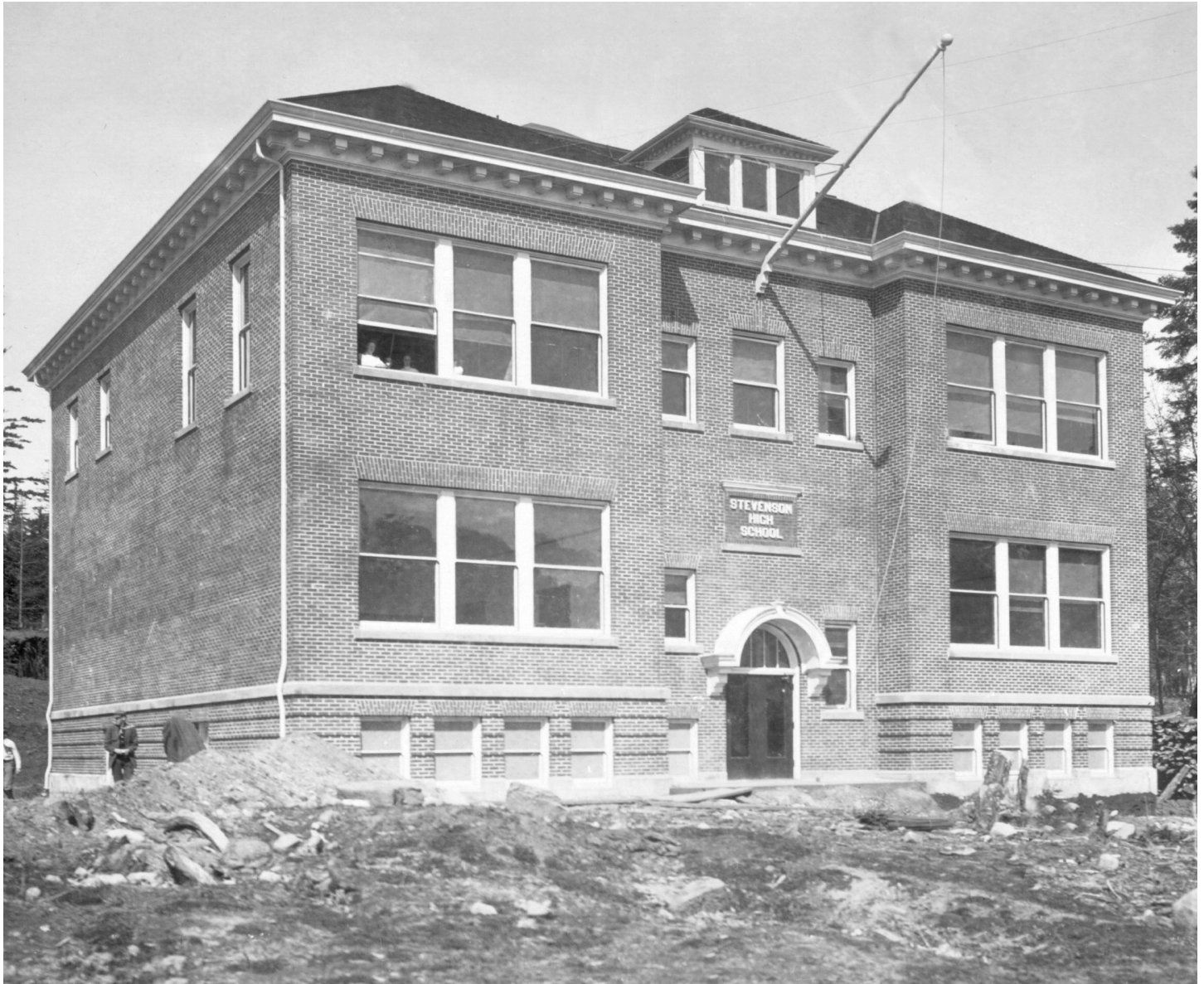
Brand new Stevenson High School. Even though the landscaping wasn't finished, the school was in use. c. 1915.