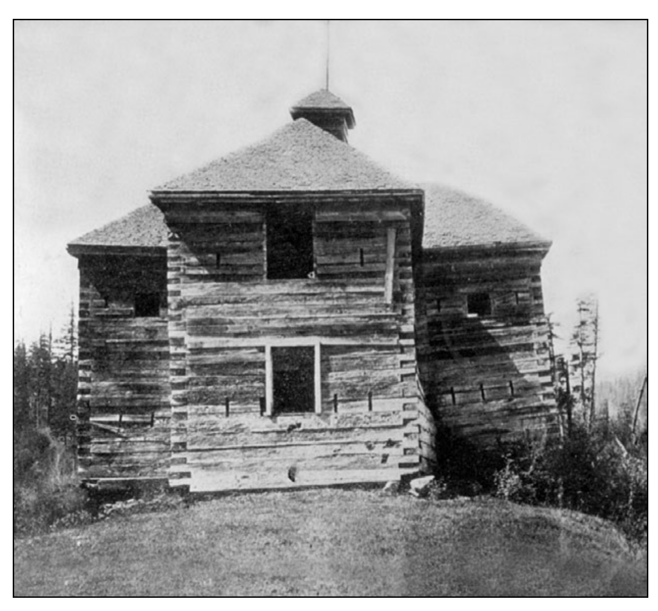
Original Courthouse at Lower Cascades. It was used from 1854 to 1893, when the county moved their facilities to Stevenson. The Territorial Courthouse at Lower Cascades stood until 1921. The small lean-to in rear is the old jail. This was originally used by the Army as part of the Fort Cascades compound.

had been spent in the Cascades area. Within the next hour I was to learn where the old jail and saloon had stood.