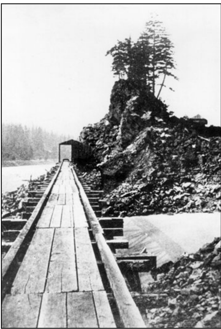
The old portage railroad, operated originally by mules or horses pulling flat-bed cars around the Cascades on a semicircular course of six miles. Rawhide was used at first tocover the wooden rails, but wolves would chew it off. Strap iron was then used until iron T rails were laid. Fort Rains is on the hill at right center. Photo taken prior to 1876.

As we came out of the tall grass a natural clearing lay before us. Here was an ideal spot to use the metal locator. Not far from the river's edge I picked up a very strong reading. Gus