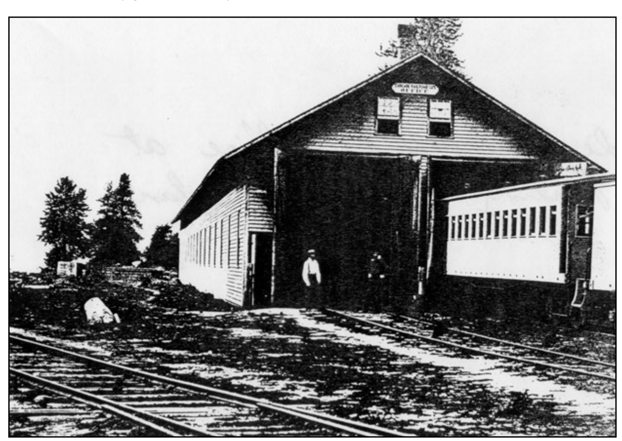
Cascade Railroad Co.'s office at the Lower Landing on Hamilton Island.

There is one thing, though, that I shall retain, and this is the kerosene reservoir. This I have made into a lamp to remind me over the years of the many enjoyable weekends we spent searching for the lost garrison of the Cascades.