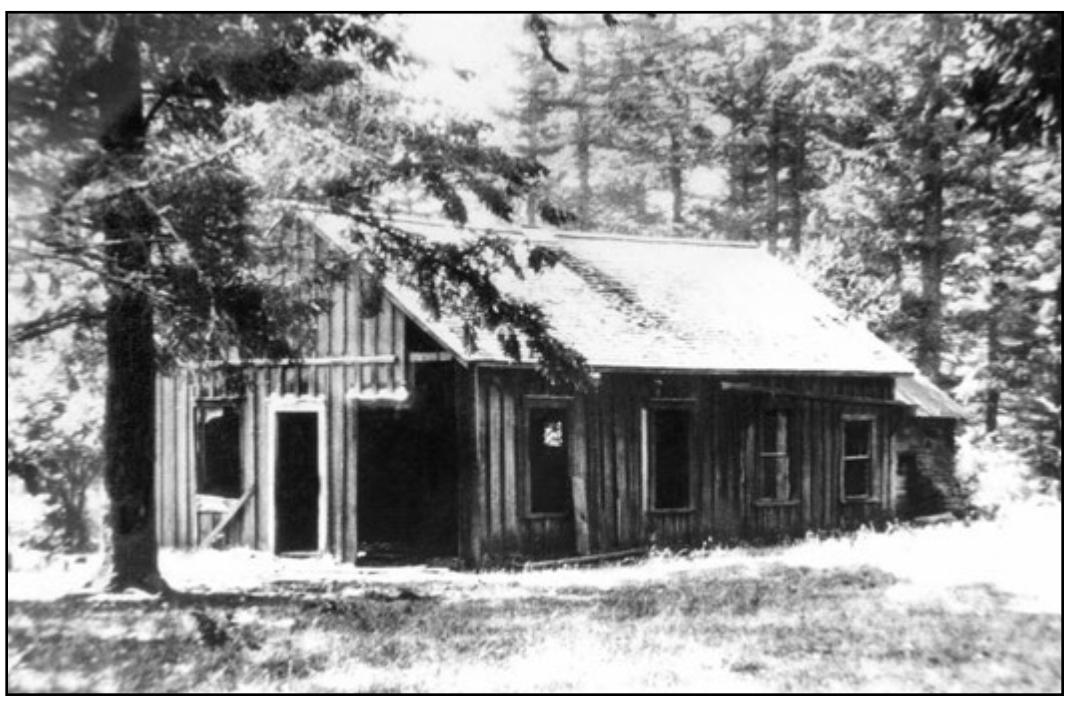
Original Courthouse at Lower Cascades. It was used from 1854 to 1893, when the county moved their facilities to Stevenson. The Territorial Courthouse at Lower Cascades stood until 1921. The small lean-to in rear is the old jail. This was originally used by the Army as part of the Fort Cascades compound.

(Reprinted from FRONTIER TIMES Magazine, March 1867)